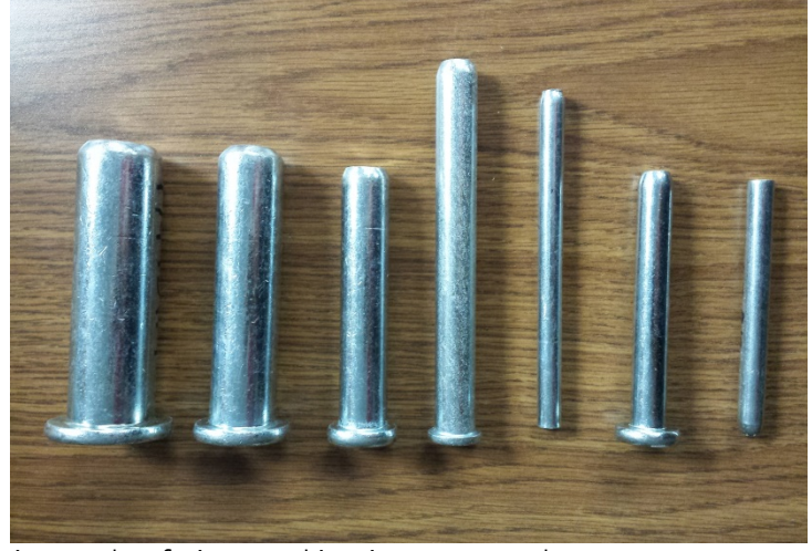
A sample of pins used in pin-connected trusses. From L to R: 1.25", 1.0", 0.75", 5/8", 3/8", 1/2" and 3/8".