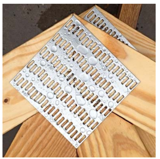
Example of a metal plate-connected truss.